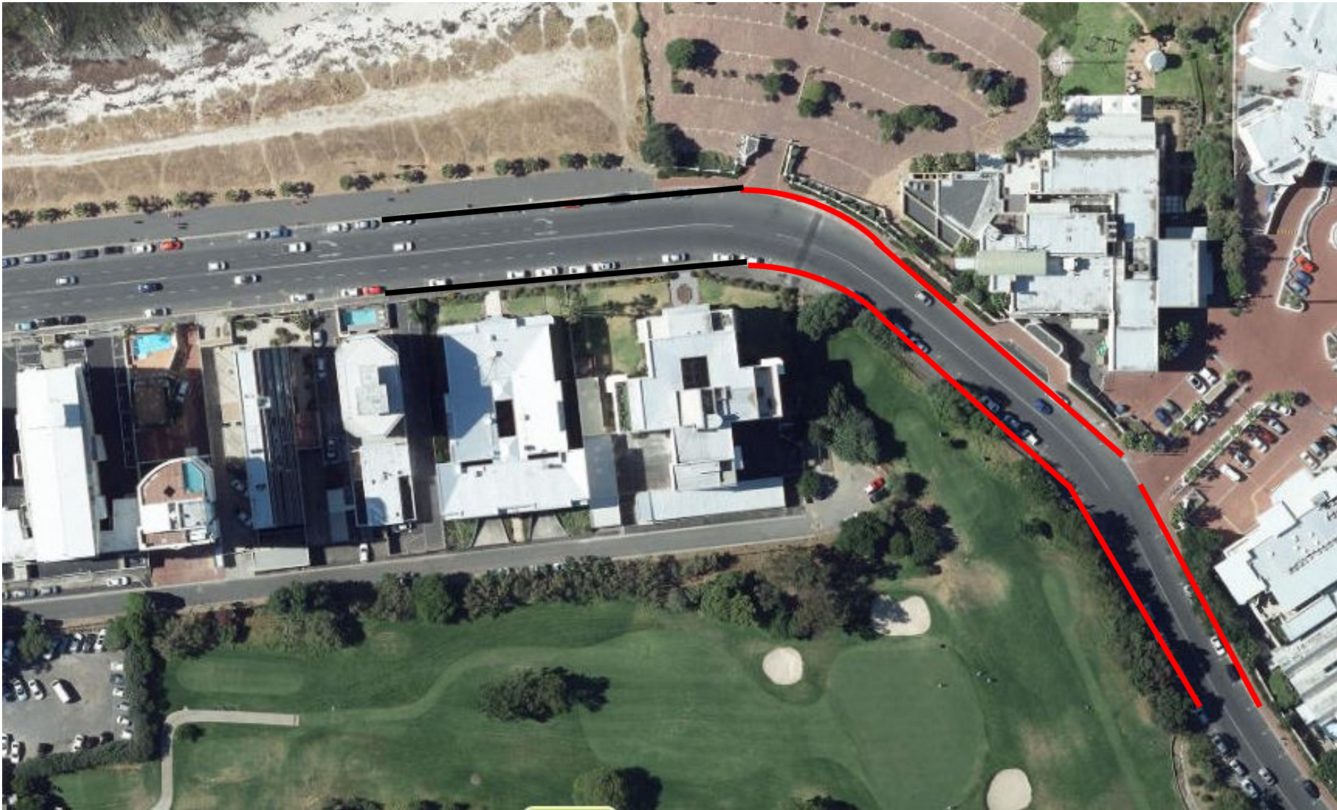
Beach Road, Start Precinct