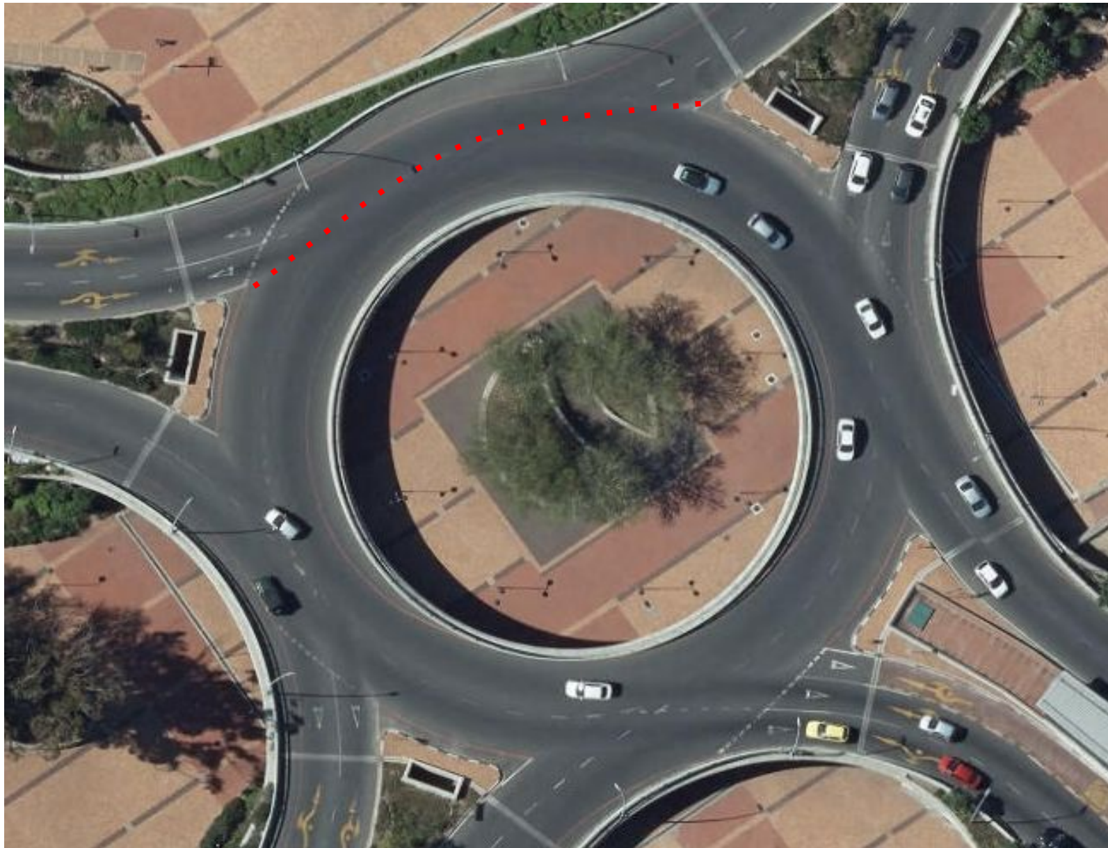
Top of circle 10km cones